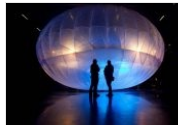
TECHNOLOGY SPECTATOR: Google's loony moonshots